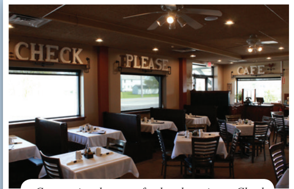
Come enjoy the great food and service at Check Please Café.

Check Please just opened, and already some crowd favorites so far have been the Breakfast Scramble topped with eggs, sausage gravy, home fries and cheese, omelets from scratch as well as the Gyro and Rueben sandwiches accompanied with homemade dressings. The Check Please Café welcomes everyone to stop in and enjoy a great breakfast or lunch. Hours of operation include Monday through Saturday 7 a.m. to 3 p.m. and Sunday 8 a.m. to 2 p.m. To see daily updates please go to the Check Please Café Facebook page. The entire Check Please Café staff thanks everyone for all the support thus far and looks forward to serving the best to the entire Village of Grafton and surrounding communities.