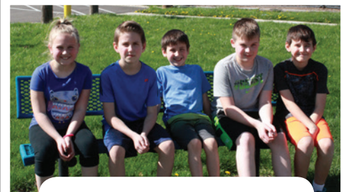
Students enjoying the nice weather at Grafton's North Park.