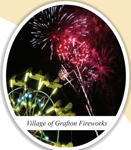
Village of Grafton Fireworks