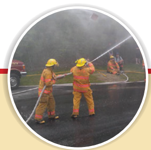
Community members enjoying the Village of Grafton's Fireman's Festival Activities.

Instant Bingo, Texas Hold'em, Poker, Blackjack: 3-8 p.m.