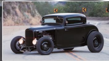
1932 FORD 3-WINDOW, BUILT BY JOHNSON'S HOT ROD SHOP IN GADSDEN, AL, FOR JON WRIGHT

CELEBRATING 48 YEARS! 440-926-3116 | CUSTOMCHROMEPLATING.COM