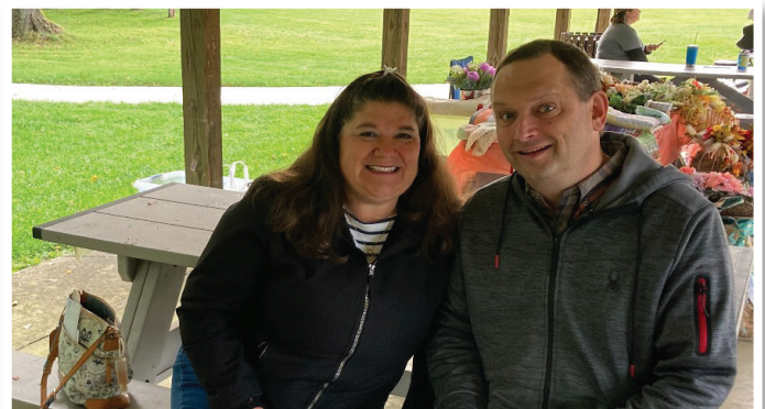
Participants at the 2nd Annual Fall Festival came together on Saturday, October 1st for seasonal fun and celebrations. See some more pictures of the event on Page 2!