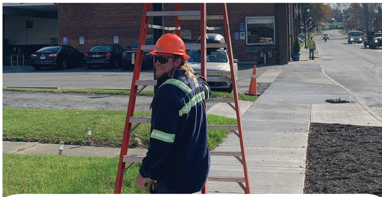
Lighting will run parallel with the streets giving the Village Main Street area a 12-month lit ambiance.

Finally, the Village is very excited about Phase 1's connection with the Ohio Rail Development Commission, and CSX, for the sake of connectivity and safety. Where in the past bicyclists and pedestrians had to cross the street merging with traffic, now, this current configuration will not require such a merger, since walkers and bikers can cross independently of traffic.