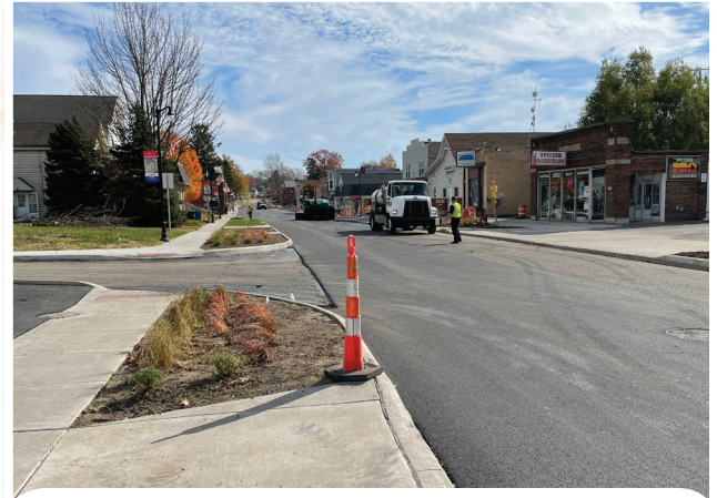
Envision Grafton Phase 1 enhancements have improved the Main Street Corridor with a new surface, parking, sidewalks, landscaping and lighting.

As many residents know, the Main Street reconstruction progress has all been completed, and save for a punch list of items, the main thoroughfare for Grafton motorists and pedestrians is bound to become an entirely new and improved experience. With principal construction completed during the week of October 24th, the overall progress of the project went as expected. The Phase 1 component of this project comes in conjunction with a separate project, the Parsons Road resurfacing, from Main Street to the Royal Oaks Metroparks entryway. Some of the finishing touches on landscaping and striping can be expected in the next several weeks. Residents can also expect new lighting in the downtown district, along with the installation of rapid flash beacons, the foundations for which have been installed. Another feature of this project will be the incorporation of reverse-in parking only in the downtown district. While some may have reservations about this feature in the project, studies point to enhanced safety as opposed to head-in parking. More information is available on reverse-in parking and is posted on our website. The Village thanks you for your patience as the project comes to a close.