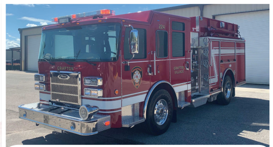
The 2022 Fire Truck pumper holds 1,000 gallons of water and was purchased to enhance safety throughout the community.

The Village of Grafton recently purchased a 2022 Pierce Saber pumper truck, replacing a truck that had been in use since 1990. This equipment upgrade, intended to help ensure safety for our residents, carries 1,000 gallons of water and can pump 1,500 gallons per minute of pump capacity. The safety vehicle can seat 4 people, and features all-LED lighting. All battery powered hand tools can be found on board as well. The purpose of purchasing this new public safety vehicle is to elevate and enhance the Village's safety and protection for residents and businesses alike. Village officials view this as a major advancement in doing so. Thank you for your continued support. Give a wave next time you see the fire truck meandering through town.