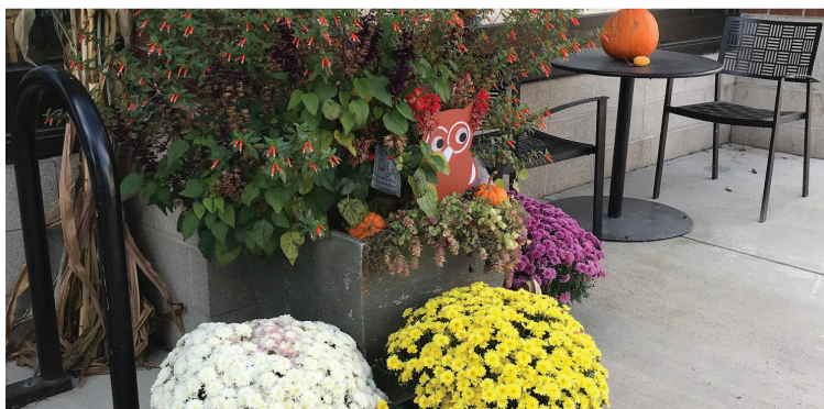
Late fall decorations will soon give way to a festive holiday season in Grafton. From our Grafton Fall Festival, to the Old Fashioned Christmas celebration, be sure to read more inside this publication.