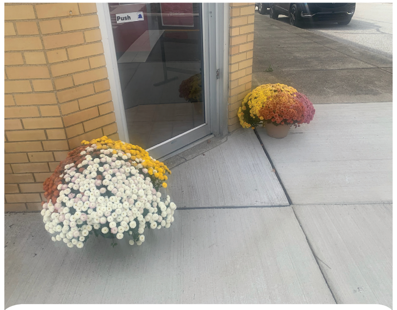
Main Street in Downtown Grafton is participating in the seasonal fun as well!

The interest in Grafton has never been greater. Your land investment is now recognized by Jobs Ohio as an Ohio mega-site for regional development. This year alone your Village has engaged in several active and future multi-billion-dollar investment interests with the support of Jobs Ohio and Lorain County Community Development. The opportunity to locate one or more emerging technologies manufactures, bio medical or pharmaceutical manufactures, is more than hopeful. The future local job creation is significant with estimates within the Village corporation limits ranging from creating 3000 to 5000 full-time careers. One positive feature is Grafton's strategic location. The Grafton site has access to a 2.4 million population within 60-minutes of Grafton, the work force development potential rates Grafton atop most Northeast Ohio communities.