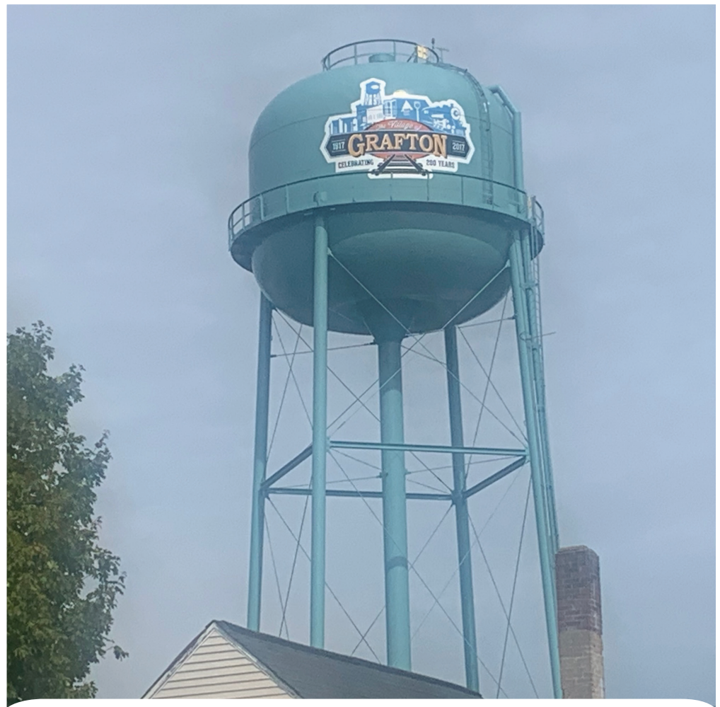
Ringing true above the streets and thoroughfares of Grafton is our beloved Water Tower.

To all the readers of this article, you've received this newsletter as you live or own a business in Grafton. You've witnessed firsthand the progress made the past 8-YEARS. Construction, although challenging our patience at times, is a necessary process to renew, renovate and restore, and when complete it is something we all can appreciate. As the question is asked; is the Grafton of today better than it was just 8 years ago? I believe it is and hope you agree.