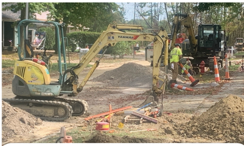
Washington Drive infrastructure is well underway to enhance water lines and adding a T-shaped turnaround for emergency vehicles

Some of the many Parks & Recreation improvements include the Willow Park playground and concert sunshade. The North Park splash pad sunshade, playground expansion & community room exterior renovations (2019). The trails at Reservoir Park are beautiful and a program of restocking the reservoir has our local outdoors-loving citizens of all ages enjoying this scenic part of Grafton.