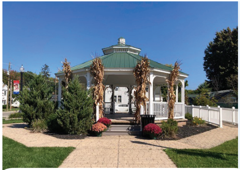
The Village's Gazebo is prepared for visitors to climb its short steps and enjoy the seasonal weather!

When appointed in 2015, Grafton's economic base had not rebounded from the post 2008 recession. Infrastructure concerns were many, home values were low, and Grafton remained known as 'the community where the prisons are.' Given the blessing of council the administration worked to rebrand Grafton to build pride and attract economic development... the results were fast as income tax paid to those employed in Grafton grew by double digits in 2016, 2017, 2018, and 2019. During COVID as communities were reporting double digit revenue losses, Grafton fared well with only a 3% decline and quickly restored double digit income tax increases in 2021 and 2022. Throughout COVID, your Grafton employees did not have a positive COVID test until January 2022. Your local government stayed open, did not work remotely and all council meetings were held in-person.