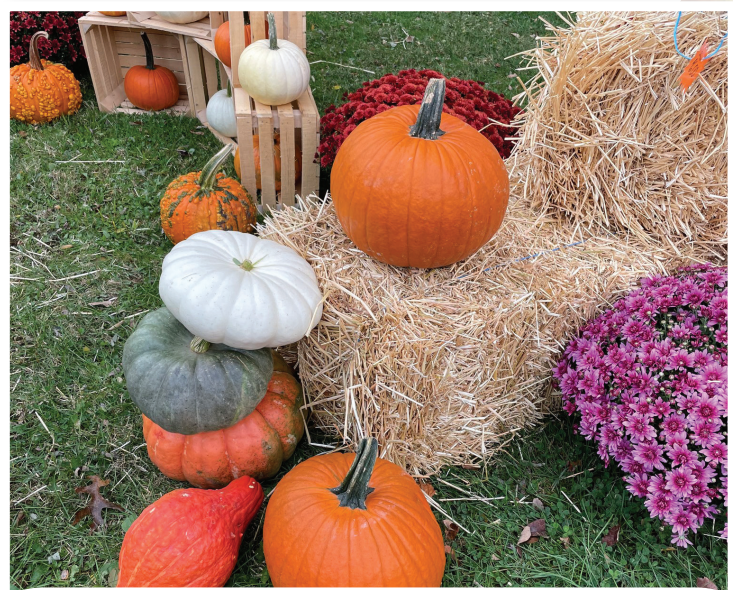
Fall is alive and well in Grafton, Ohio.