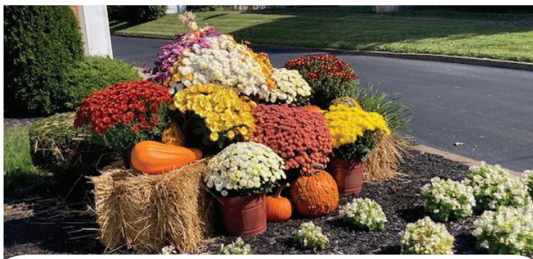
The fall season brings out the best in decorations and seasonal emotions throughout the Village.