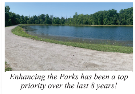
Enhancing the Parks has been a top priority over the last 8 years!

The Grafton Wastewater Treatment system and facilities have likewise been given much attention. The 5,500,000-million-gallon EQ Basin completed in 2015 at a cost of $3,500,000 has nearly eliminated all sanitary sewer backups during heavy storm events. This combined with the many roadway reconstruction improvements, each with sanitary sewer capacity improvements, have improved the quality of sanitary service. The 2019 plant improvements included a new $1,300,000 centrifuge dewatering system that improved the quality of product and lessens shipping weight lowering trucking costs. The facility had sought to construct a new administration and service building in 2012 at a cost of $875,000. We were able to finally build the new administration building in 2021 at a project bid price of less than $700,000 with added items. Even with the number of improvements, the most remarkable benefit comes in the low sewer rate Grafton WWTP customers pay... the lowest cost regionally in monthly minimum and cost per 1000-gallon of treatment.... 40% less than other areawide operators.