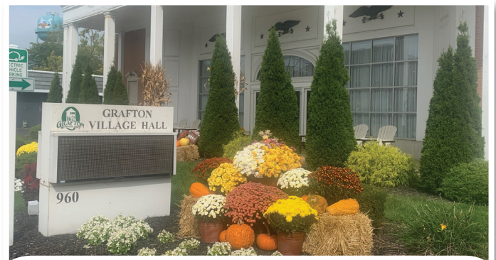
Village Hall joins the other establishments in downtown Grafton which has ushered in the autumn season with appropriate décor.