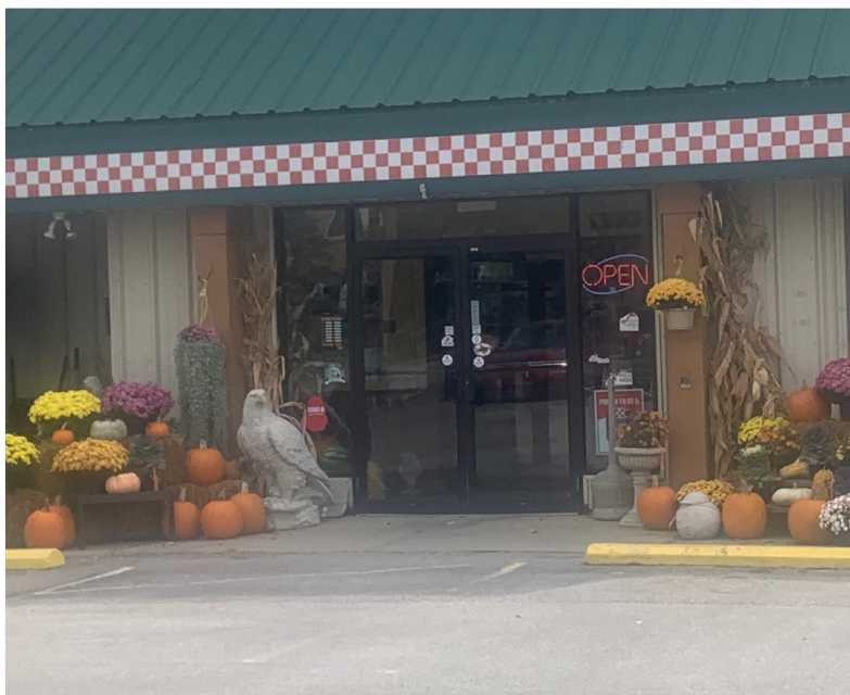
The Centerra Store has wonderful decorations for sale and for warming the seasonal senses.

The challenges of public service come often: In September 2015 the Village Water department lost its only licensed water distribution Operator of Record. The supervision of the streets and water had not motivated or trained backup water personnel. In September 2015, Grafton water was required to hire an out of department licensed operator to cover hours and reporting. The department would not have an in-house licensed operator until 2020 when an employee successfully passed the licensing requirements, a second operator was licensed in 2021, a third in August of 2022 when we released the out of department licensed operator hired in 2015, we had full confidence in the qualifications and experience of the (then) two in-house department licensed operators. As it happens, April of 2023 saw the operator of record, trained by Grafton, move on to another opportunity. Still having two licensed operators provided the needed backup and a new operator of record was assigned and registered with the EPA in April 2023. Water samples were still pulled daily, reports to the EPA were kept up to date. The 2022 Consumer Confidence Report (CCR) report was due to the EPA in June 2023, it was submitted to the EPA, approved by the EPA, and was published prior to the EPA deadline. Lead & Copper samples and reports are current, the Grafton water distribution system maintains the high quality and standards you expect.