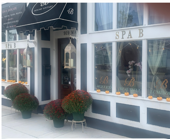
SpaB always does a great job with seasonal decorations.